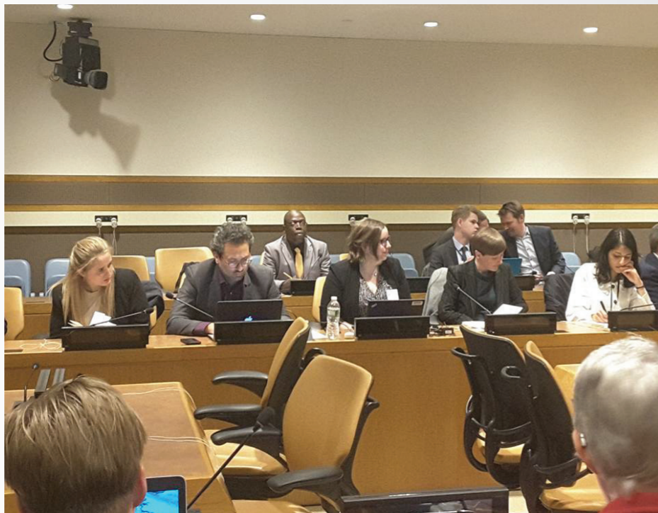
During a session