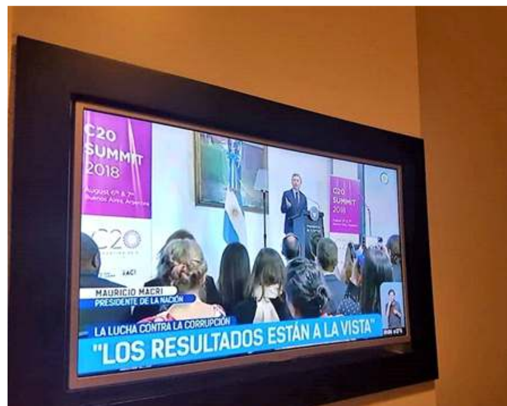
The President of Argentina addresses the C20 Summit

management reform in general and a debt workout mechanism in particular; to stock-take substantial debates, strategic successes and failures through campaigning and advocacy history; to establish a basis for joint advocacy and campaigning efforts in the short and medium term and to agree on a coordinated medium-term strategy towards global reform.