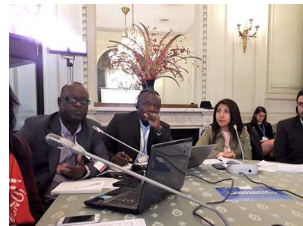
The C20 Summit Delegation